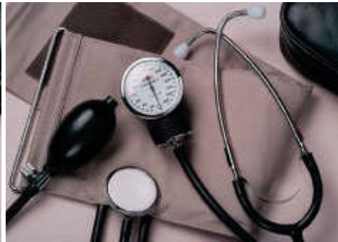
Home Blood Pressure kit Aneroid Complete with Stethoscope Attached and Adult Cuff Model SSAWS