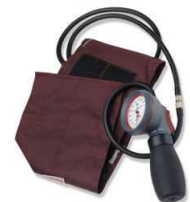
Welch Allyn /S&K ( Speidel & Keller ) One handed aneroid Trigger action air release Complete with adult cuff and carry case