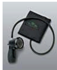
Welch Allyn DS66 • Jeweled Movement for Long life • Laser engraved for accuracy • Shock resistant • 15 year calibration warranty • Trigger action air release for ease of use