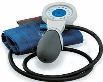
Heine—Germany One Handed Aneroid Larger dial for easy reading Complete with adult cuff and sturdy carry case. Model Gamma G5