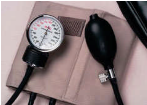
Basic Aneroid Sphygmo in case Complete with adult cuff Model HS-20D